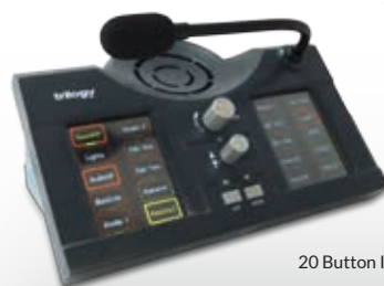
20 Button IP 'Touch' Desktop 700-47-03