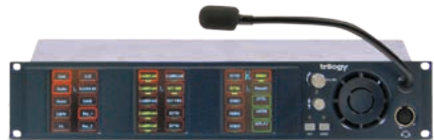
30 Button IP 'Touch' 2U Panel 700-37-03

Features include: 8-character color displays; pop-up telephone dial pad; color-coded key functions for listen/speak; individual audio level adjustment; signal presence and incoming call signaling; audio replay facility.