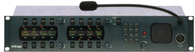
16 Lever Key 2U Panel + Phone Keypad 700-31-52B