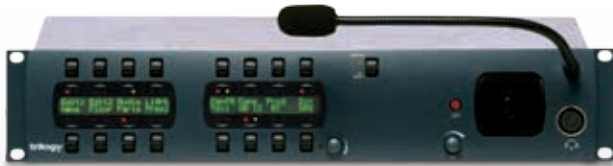
16 Lever Key 2U Panel 700-31-01B