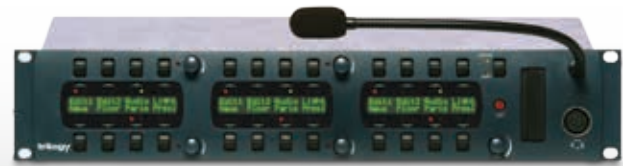
24 Lever Key 2U Panel 700-30-51B