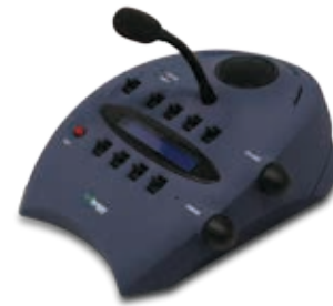
8 Lever Key Desktop Panel 700-41-02