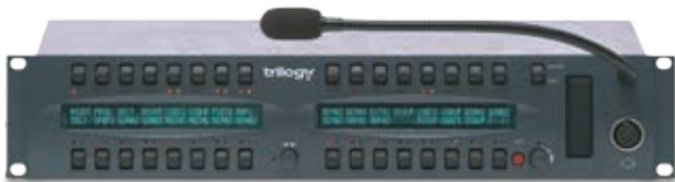
32 Lever Key 2U Panel 700-33-01B